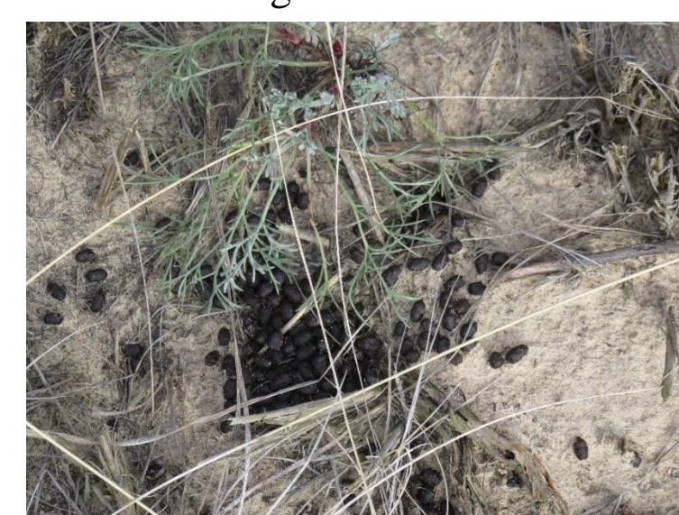
Figure 4. Deer scat.