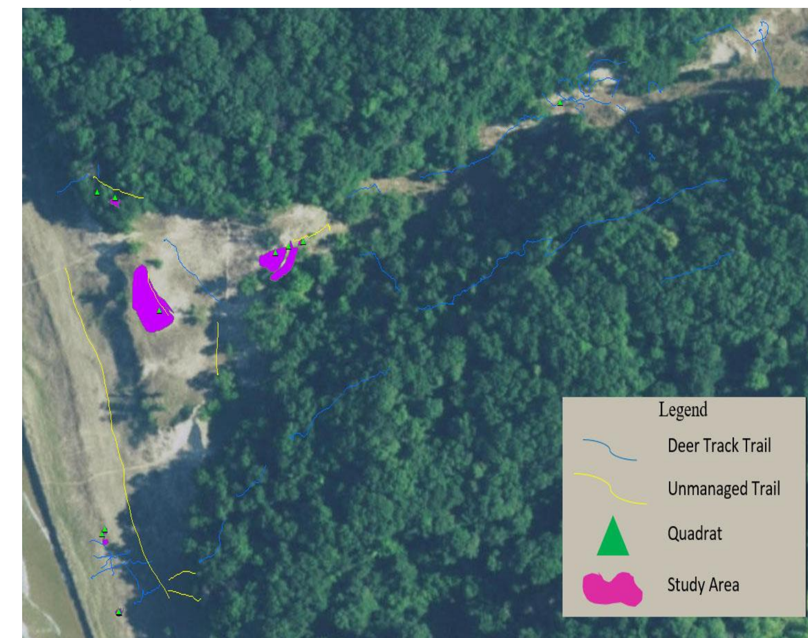
Figure 6. Describes the study areas we visited, the unmanaged trails, the deer trails, and the quadrats we threw.

Figure 6 shows that deer stay on unmanaged trails for as long as possible, until they must divert from the trail. Deer prefer to travel through the forested arms of the dune onto the foredune rather than using any other route to access the lake front, based on the data from our study areas.