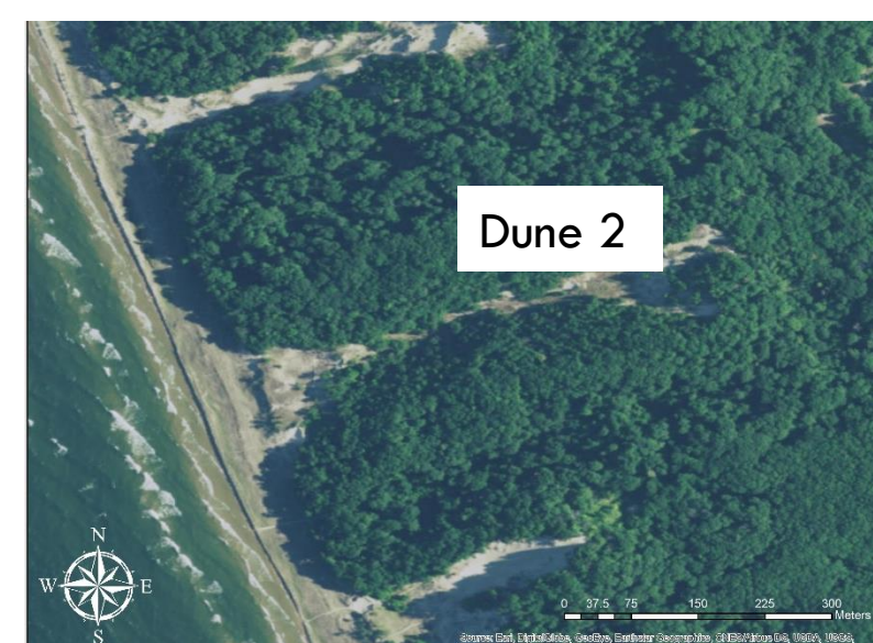
Figure 1. View of the parabolic dune system in Hoffmaster State Park, Michigan

Biologists have assessed P.J. Hoffmaster State Park's carrying capacity of deer to be 65, yet there is an estimated 3-4 times that many deer throughout the park, whose impacts can be studied by observing deer trails and other deer evidence [2]. We focused on six different areas on the dune system (Figure 1): the foredune, dune ridge, blowout, second dune ridge, north arm, and second trough.