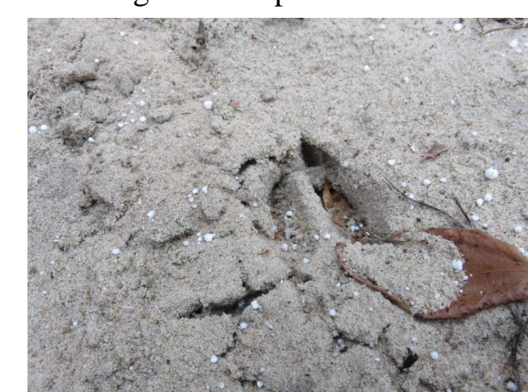
Figure 5. Singular deer print.