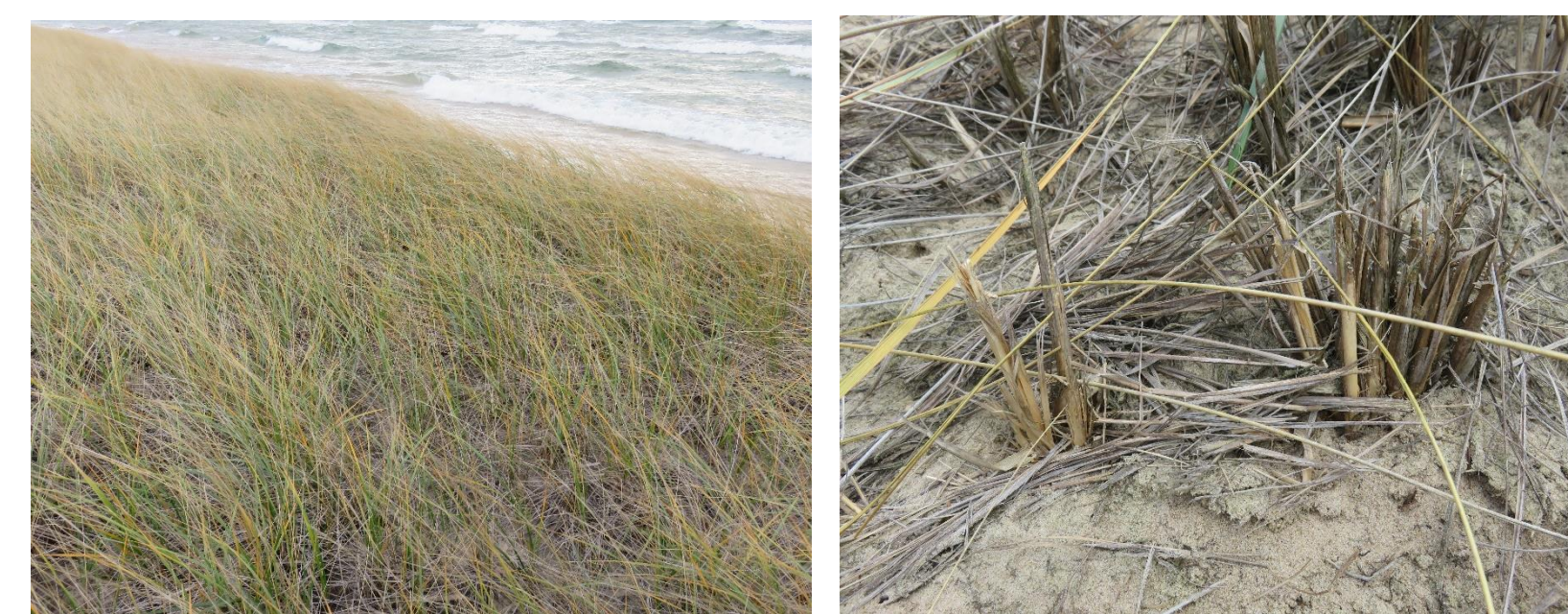
Figure 2. The left photo shows an example of vegetation rated a 5 and the right photo rated a 1 on the vegetation scale.

Using Trimble GPS units, evidence of deer (tracks, scat, trails, hair/antlers) were mapped in our six study areas.