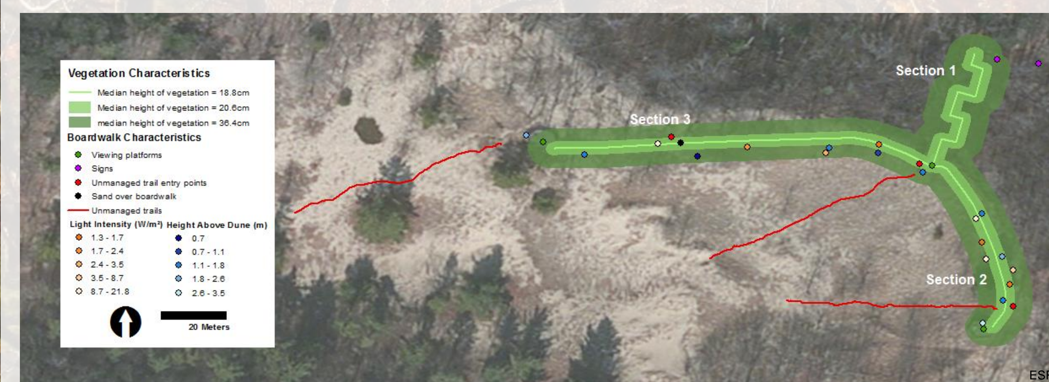
Figure 3: Mapped boardwalk and features in the study area. Vegetation height at 0, 1, and 5 meters from the boardwalk is shown in green.

Boardwalk Characteristics: The boardwalk has a total length of approximately 193 meters and is divided into three sections (Figure 3). Section 1 is the new Dune Climb, while the older sections 2 and 3 are built along the dune crest and north arm. Signage and barriers on the older parts of the boardwalk are scarce. The section with greater average height above the ground has a higher light intensity beneath it (Table 2).