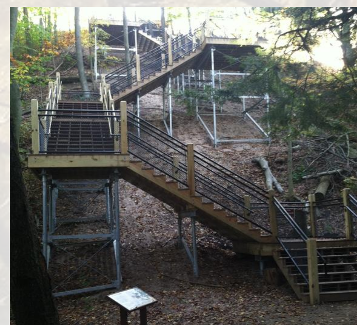
Figure 2: New Dune Climb (Image taken during data collection.)