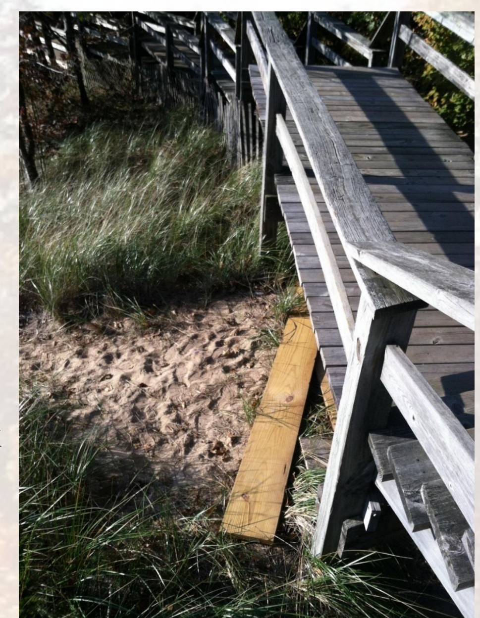
Figure 6: Unmanaged trail entry point, with leftover construction material