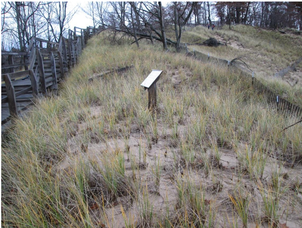
6 November 2014: Planted A. breviligulata viewed from upper north arm (see 16 September 2009 photo for comparison).