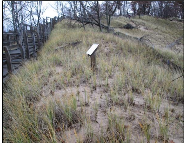
Figure 1: Planted Ammophila breviligulata at North Beach dune, Michigan.

Ammophila breviligulata (American beach grass) is a commonly used beachgrass for management and stabilization purposes because of its tolerance for burial (Figure 1). It extends its roots laterally, forming rhizomes sometimes several meters long that help it to sustain erosion and deposition occurring frequently in a dynamic dune environment (Maun 1985). There have been many studies done on A. breviligulata and how it helps to stabilize dune systems (Freestone and Nordstrom 2001; Emery and Rudgers 2011). But few studies have been done specifically on plant characteristics several years after planting. This study focused on planted A. breviligulata and its establishment on a Lake Michigan dune 5-10 years after planting.