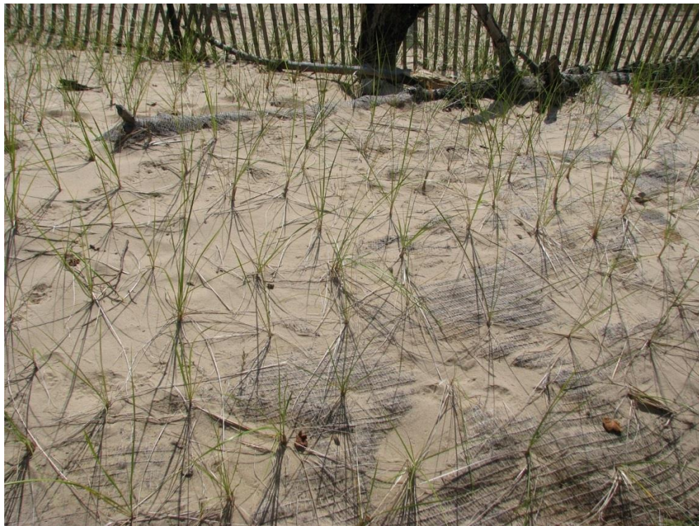
16 September 2009: Planted A. breviligulata in biodegradable mat near crest of dune.