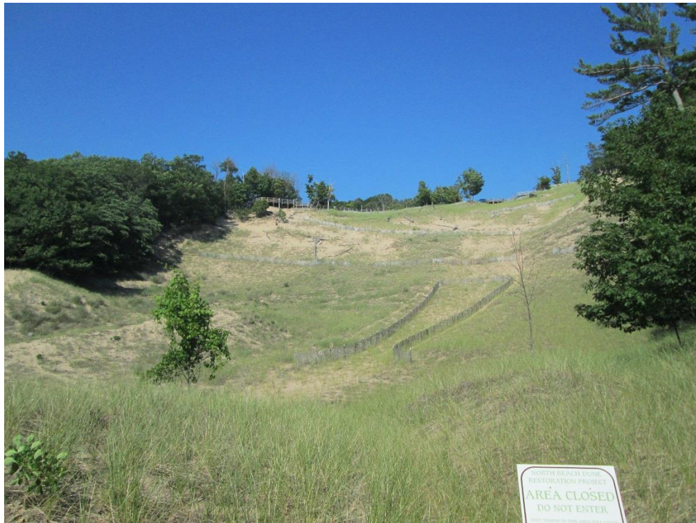
18 July 2013: Windward slope of North Beach dune as viewed from lower boardwalk.