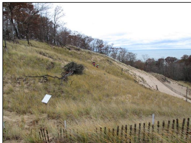
Figure 7: A. breviligulata has spread over much of the windward face of the dune

Photographs show a spread of A. breviligulata , suggesting that the plantings have been successful in re-establishing vegetation on the upper windward slope (Figure 7). A sign of recovering ecological health is the presence of additional species such as C. pitcheri and A. campestris . These two species are of specific interest, as they are rarely found in restoration sites (Emery and Rudgers 2010). Because both were found, there is evidence that the North Beach restoration has potential to grow further into a natural distribution of species as opposed to a monoculture of planted vegetation. The presence of these two species does not suggest that the entire vegetation population resembles a natural