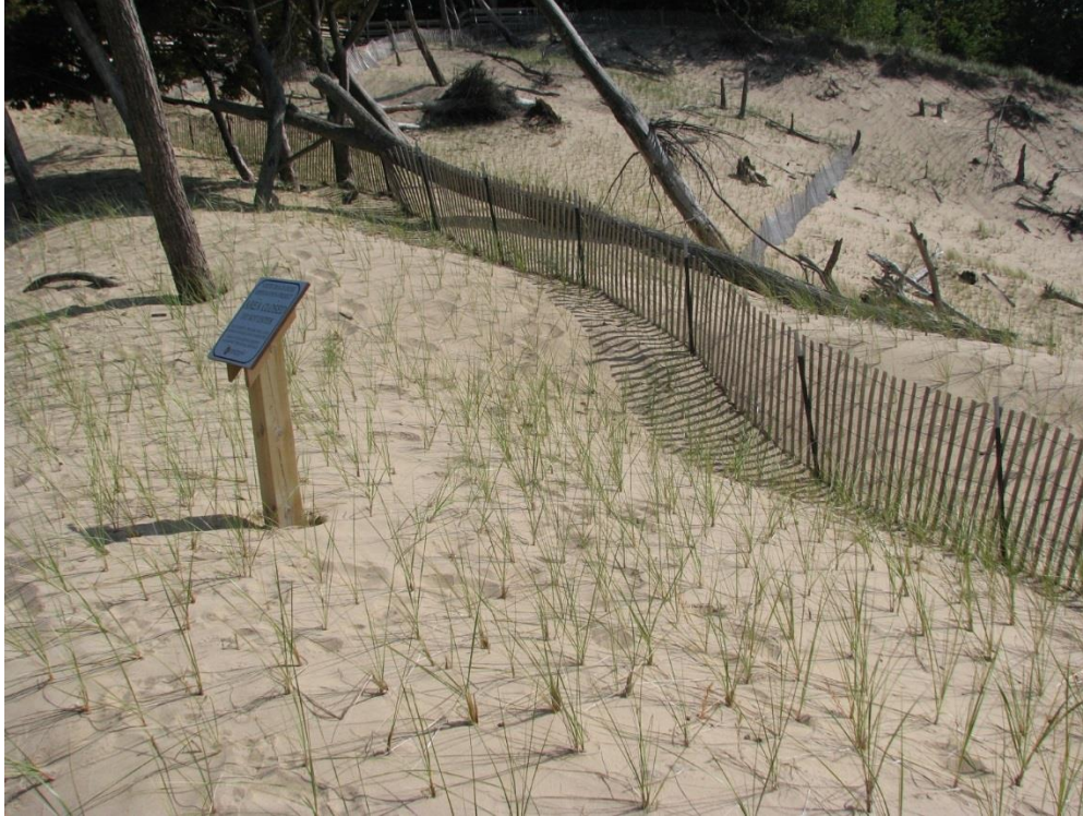
16 September 2009: Planted A. breviligulata viewed from upper north arm.