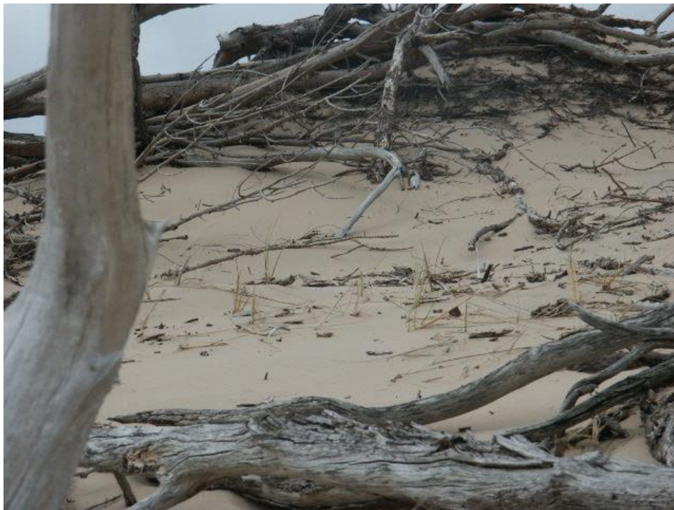
24 May 2005: Planted A. breviligulata among debris on upper windward slope. (Later observations suggest that few if any plants survived from this planting).