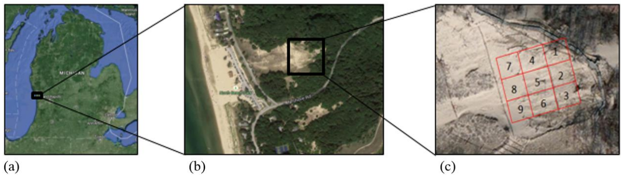
Figure 2: Study site location (a) and map (b). Focus was the upper windward face of North Beach Park dune. Zones have been overlaid to show division of sampling (c).

This study took place on North Beach dune, a large parabolic dune on the central east coast of Lake Michigan (Figure 2). The dune is located north of Grand Haven and south of Hoffmaster State Park. North Beach dune is part of the North Ottawa Dunes county park managed by the Ottawa County Parks and Recreation Commission. The focus of this study was the upper windward face of the dune—just west of a sand fence running laterally across the dune face—where it is known that a large amount of plantings have occurred.