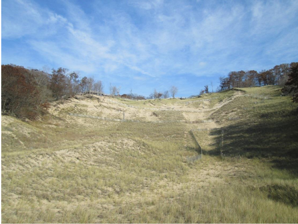
October 2012: Windward slope of North Beach dune as viewed from lower boardwalk.