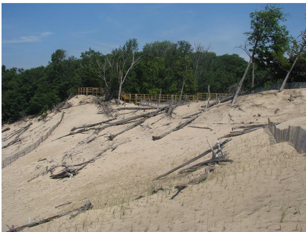
17 July 2008: Planted A. breviligulata between sand fences on upper windward slope. View is from south arm of dune.