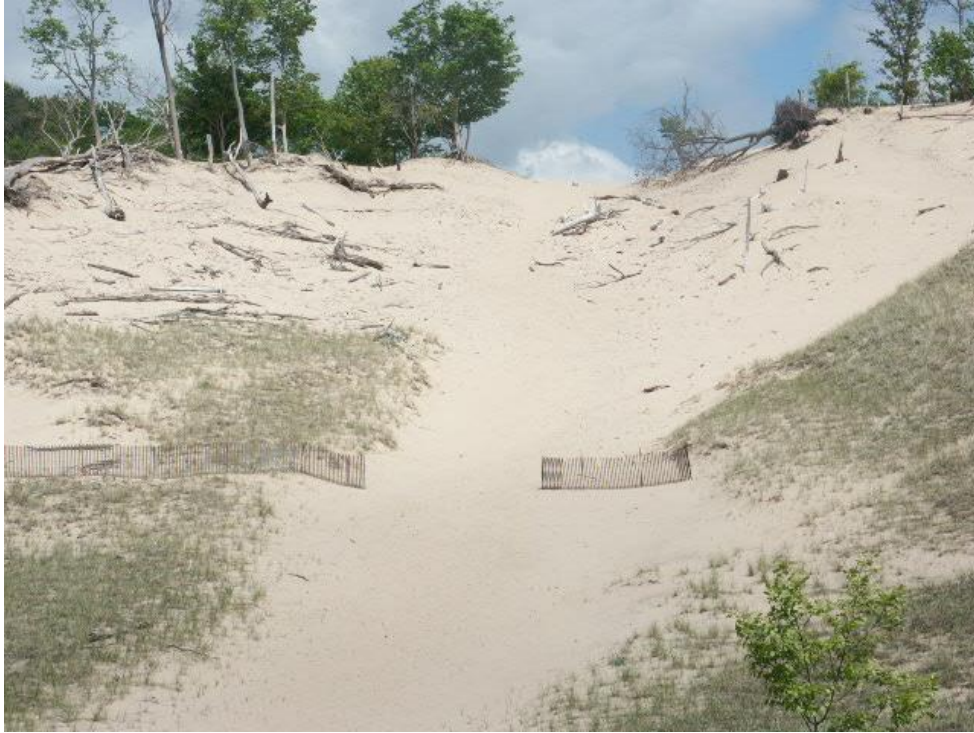
24 May 2005: Upper windward slope of North Beach dune.