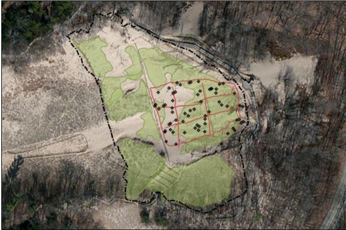
Figure 6: GPS map of vegetated areas. Shaded green areas are vegetated, red lines are zone boundaries, and black diamonds are quadrat locations.