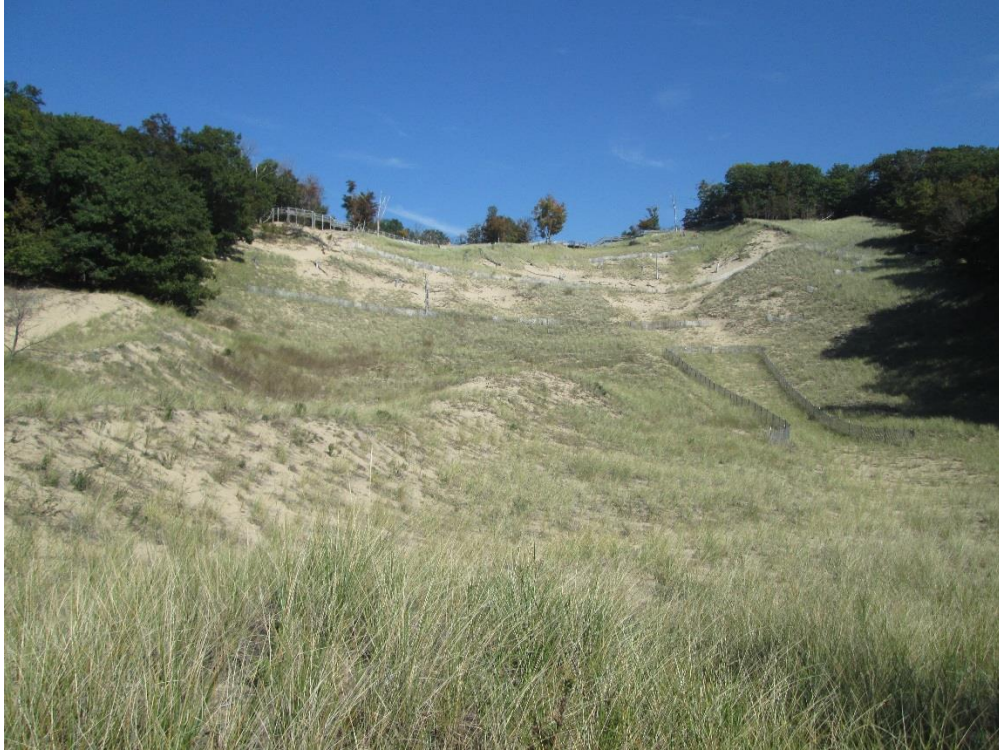
25 September 2014: Windward slope of North Beach dune as viewed from lower boardwalk.