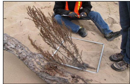
Figure 4: A researcher sampling vegetation using a 0.5m x 0.5m quadrat.