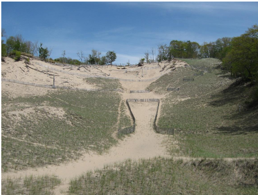
20 May 2008: Windward slope of North Beach dune.