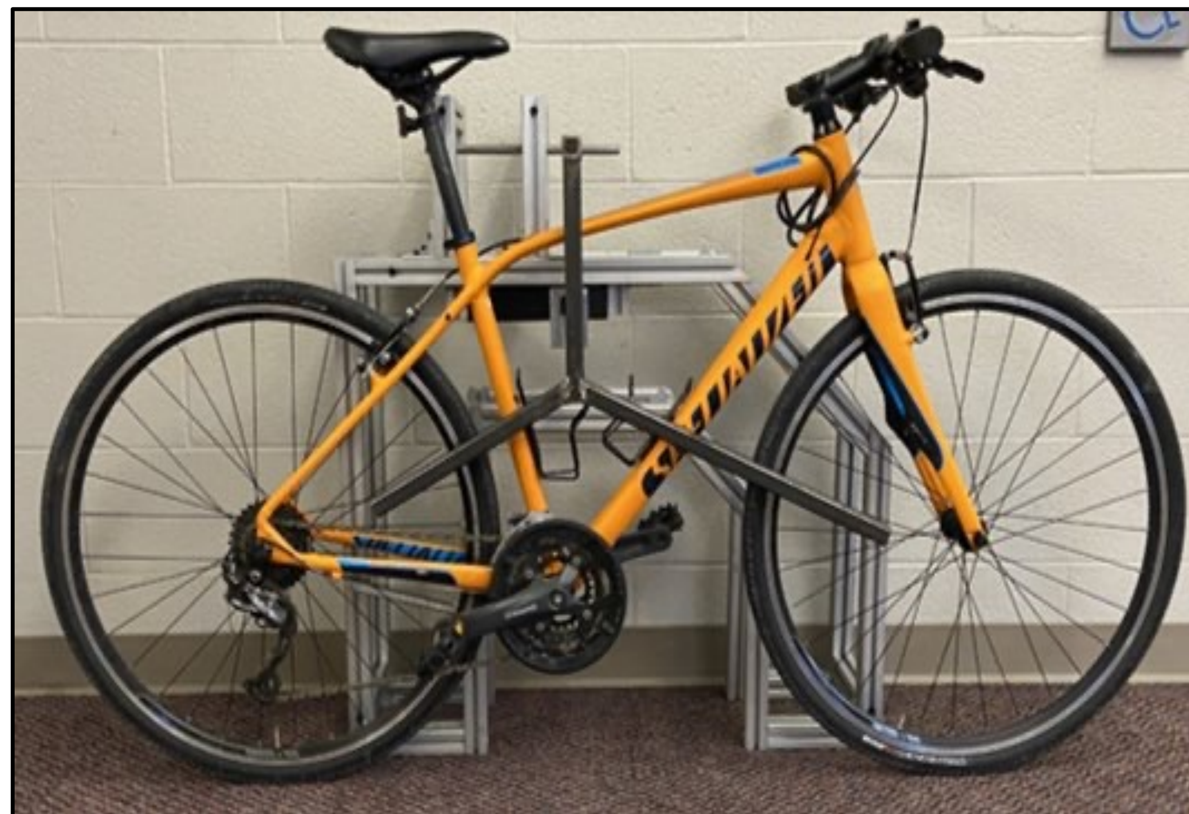
Final Design Prototype