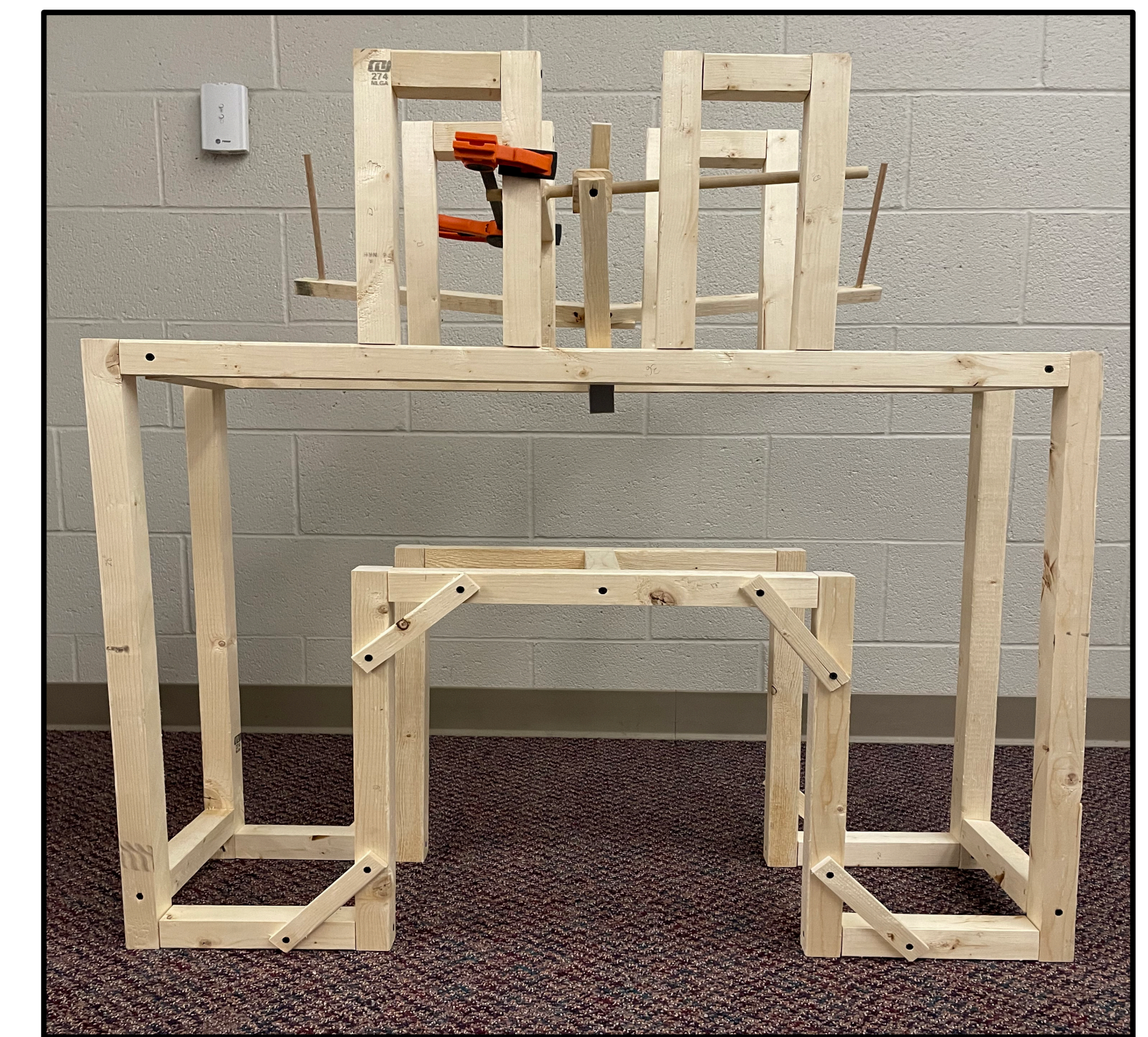
Wooden Prototype of Initial Design