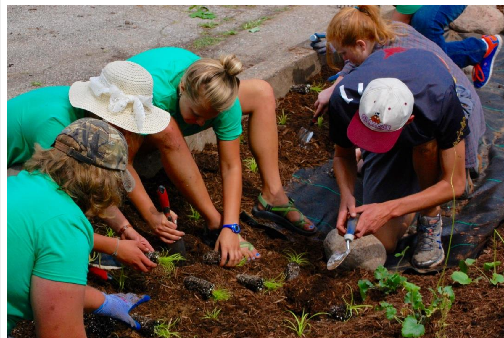
Green team members working at a rain garden in Alger Heights

As college students, we worked with the Green Team students to help guide them in a variety of ways. While we were leaders, we also worked alongside the high school students and were able to get to know them quite well. We learned a lot about their lives and shared from ours as well. We also encouraged them in their future college plans and hopefully helped to de-mystify college for them and made it more likely they would attend college in the future. In the work that we did with the students, we were able to teach, motivate, explain, and have lots of fun together.