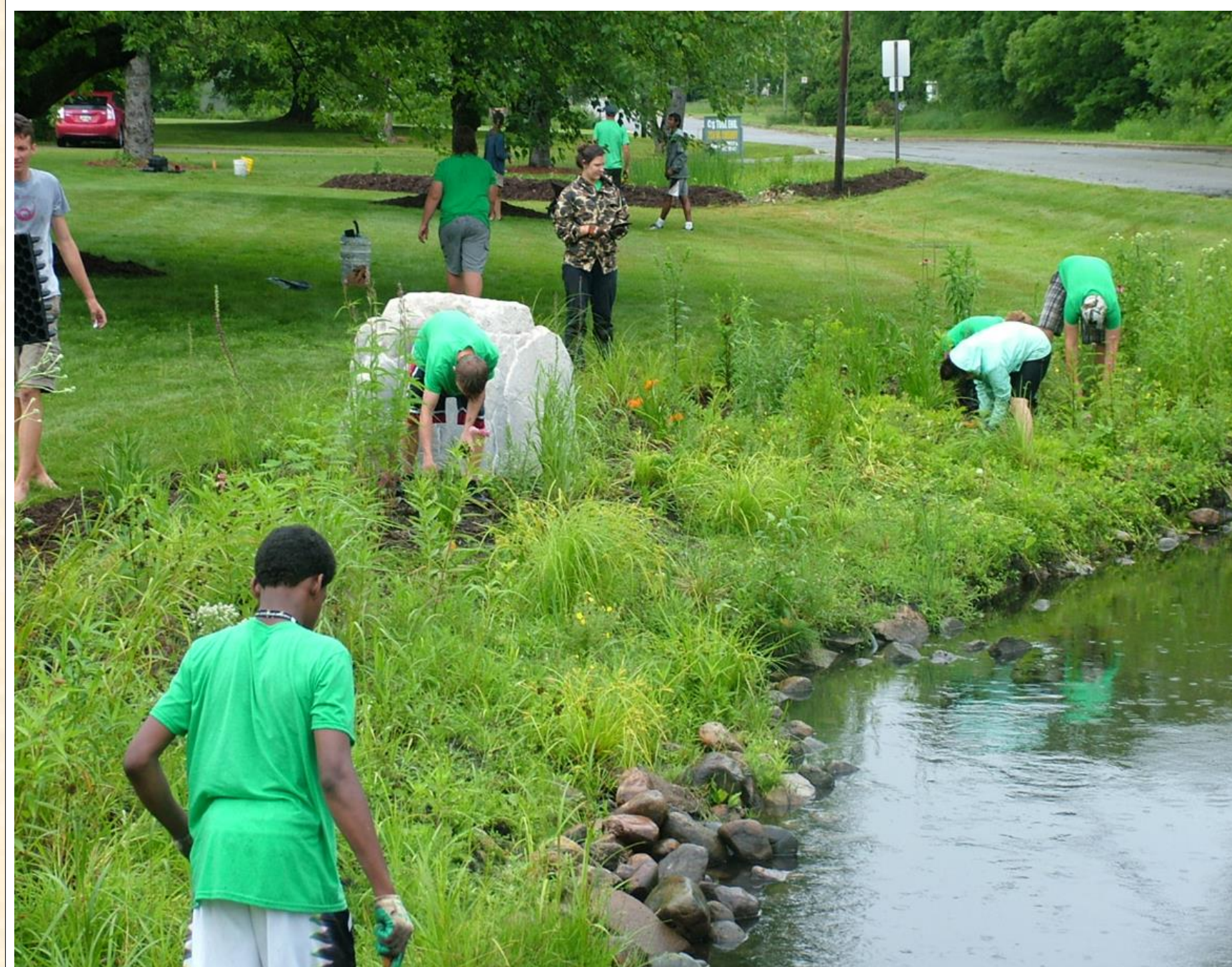
The Plaster Creek and Rogue River Green Teams planting native plants to protect the stream bank of Cedar Creek.

Summer 2015 was the third year of having two sessions of the Plaster Creek Stewards Green Team, with five students in both June and July. This year a second Green Team was initiated in the Rogue River Watershed as well. These high school students come from many different backgrounds, but all worked together with the common goal of restoring a damaged waterways.