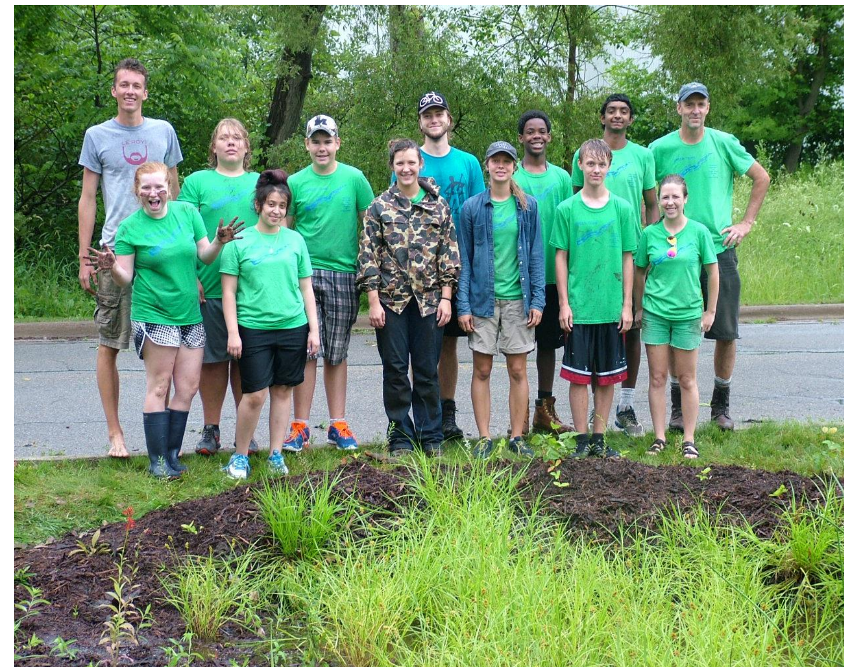
Green Team participants after a wet day of watershed restoration along Cedar Creek in Cedar Springs.

As college students, we worked with the Green Team students to help guide them in a variety of ways. While we were leaders, we also worked alongside the high school students and were able to get to know them quite well. We learned a lot about their lives and shared from ours as well. We also encouraged them in their future college plans and hopefully helped to de-mystify college for them and made it more likely they would attend college in the future. In the work that we did with the students, we were able to teach, motivate, explain, and have lots of fun together.