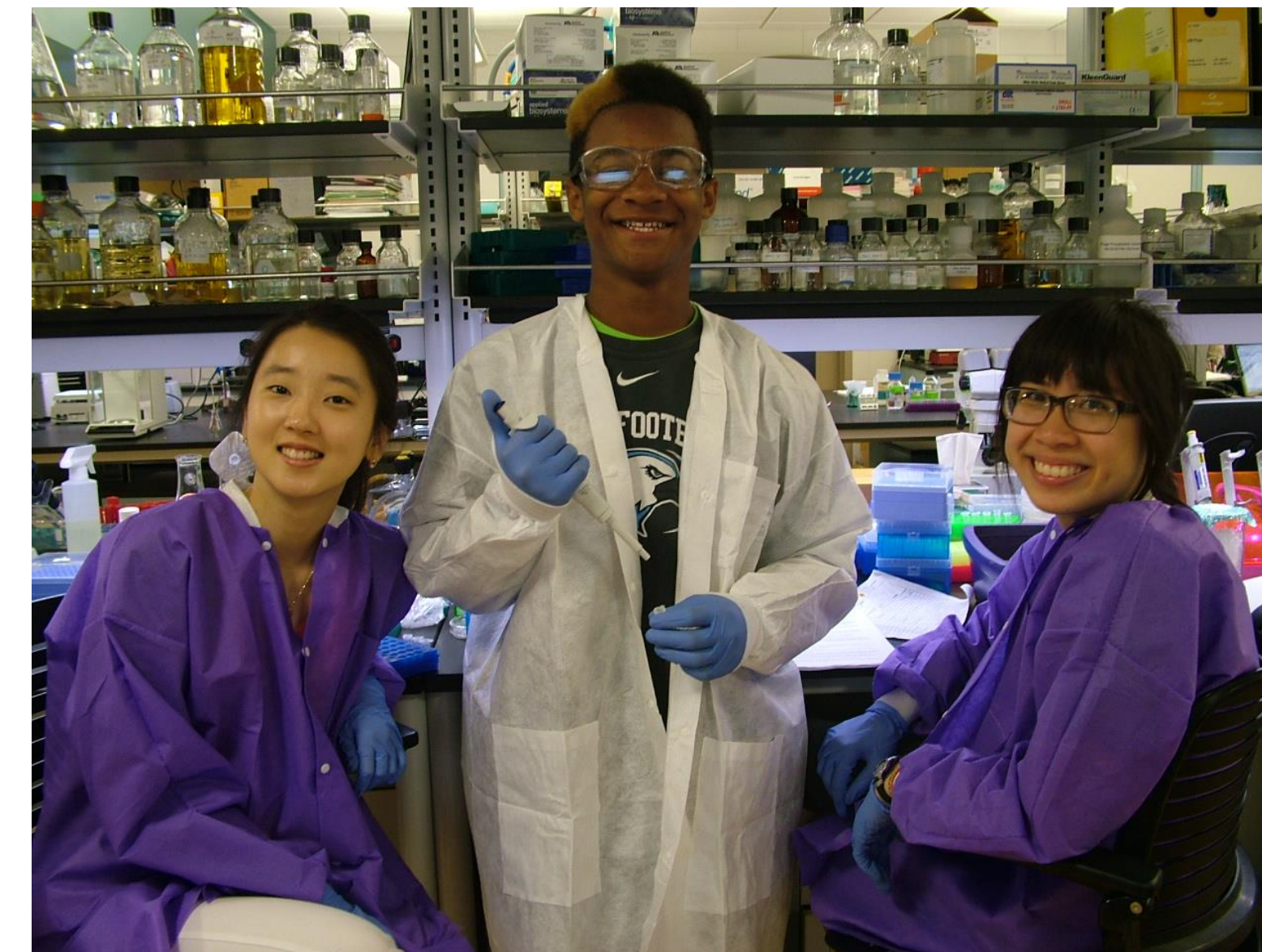
Green Team student shadowing E.coli research project with Calvin College research students.

One morning of each session the Green Team students shadowed Calvin research students in a wide variety of exciting projects.