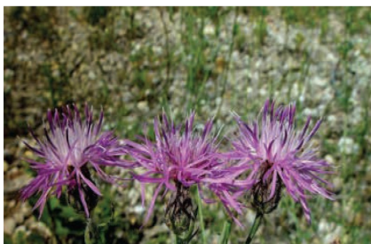
Spotted knapweed Centaurea maculosa