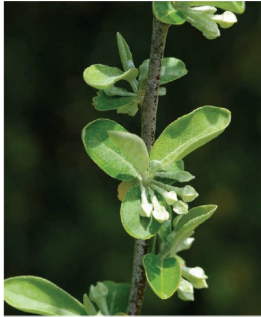
Autumn olive Eleagnus umbellata