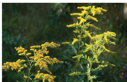
Canada goldenrod Solidago canadensis