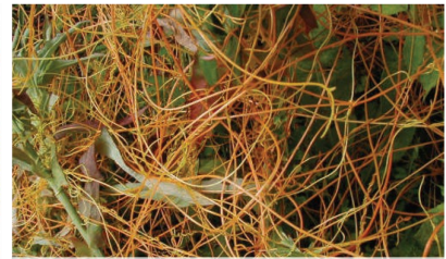
Dodder Cuscuta sp.