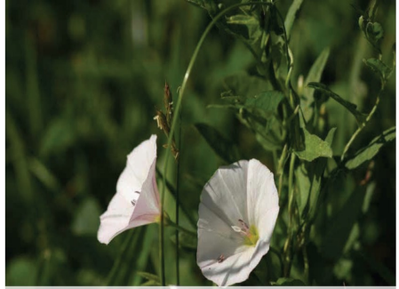
Field bindweed Convolvulus arvensis