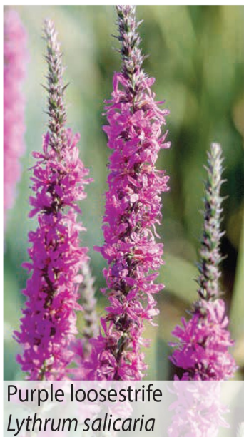
Purple loosestrife Lythrum salicaria