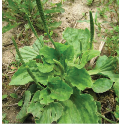
Broadleaf plantain Plantago major