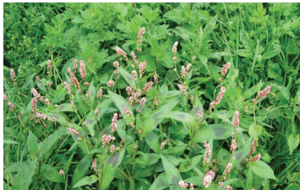
Knotweed Persicaria aviculare