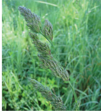
Orchard grass Dactylis glomerata