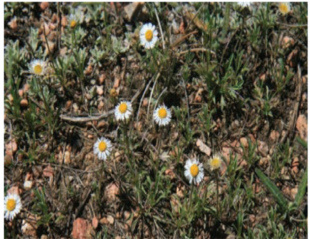
Daisy fleabane Erigeron strigosus