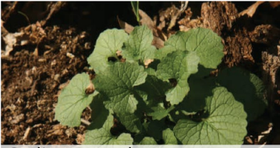
Garlic mustard Alliaria petiolata