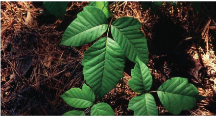
Poison ivy Toxicodendron radicans