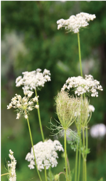
Wild carrot Daucus carota