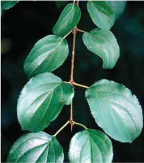
Buckthorn Rhamnus cathartica