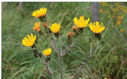
Hawkweed Hieracium sp.