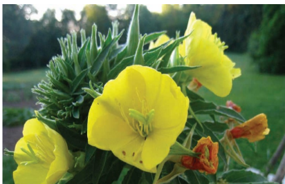
Evening primrose Oenothera biennis