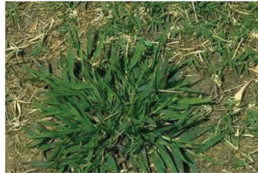
Crabgrass Digitaria sp.