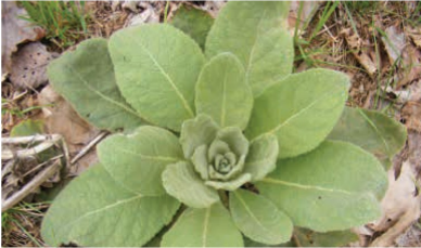
Mullein/ Lamb's ear Verbascum sp.