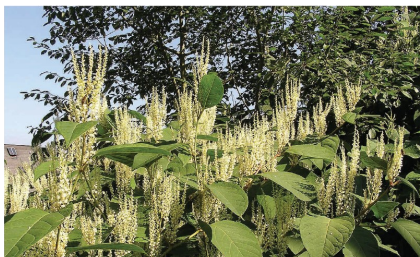
Japanese knotweed Fallopia japonica