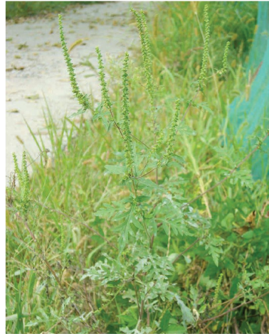
Ragweed Ambrosia artemisiifolia