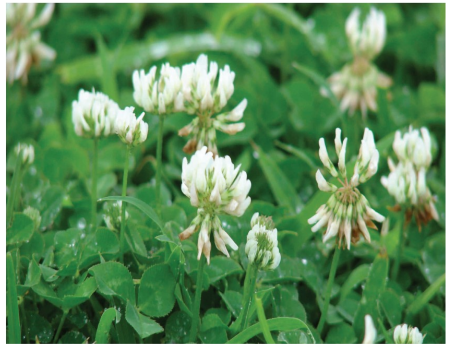
White clover Trifolium repens