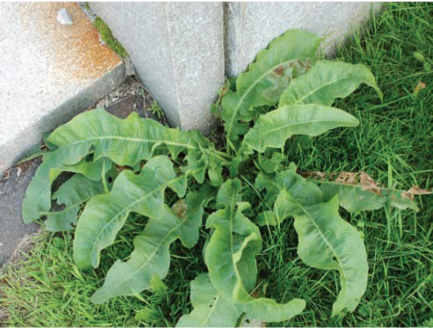
Curly dock Rumex crispus