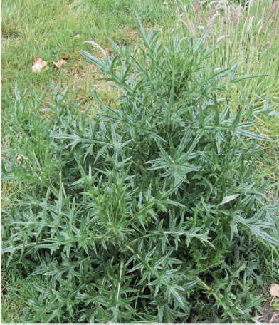
Bull thistle Cirsium vulgare