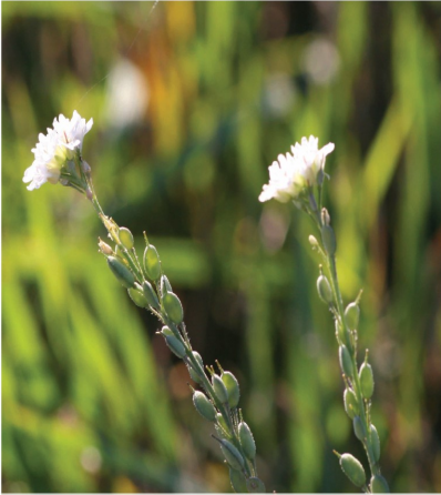
Hoary alyssum Berteroa incana