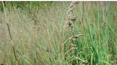
Kentucky bluegrass Poa pratensis