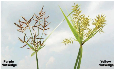
Purple Nutsedge Nutsedge Cyperus spp.