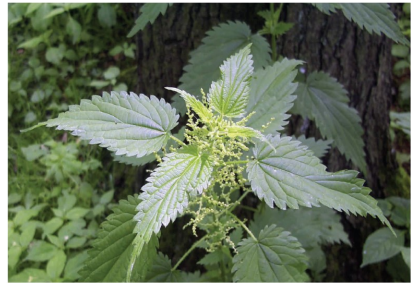
Stinging nettle Urtica dioica