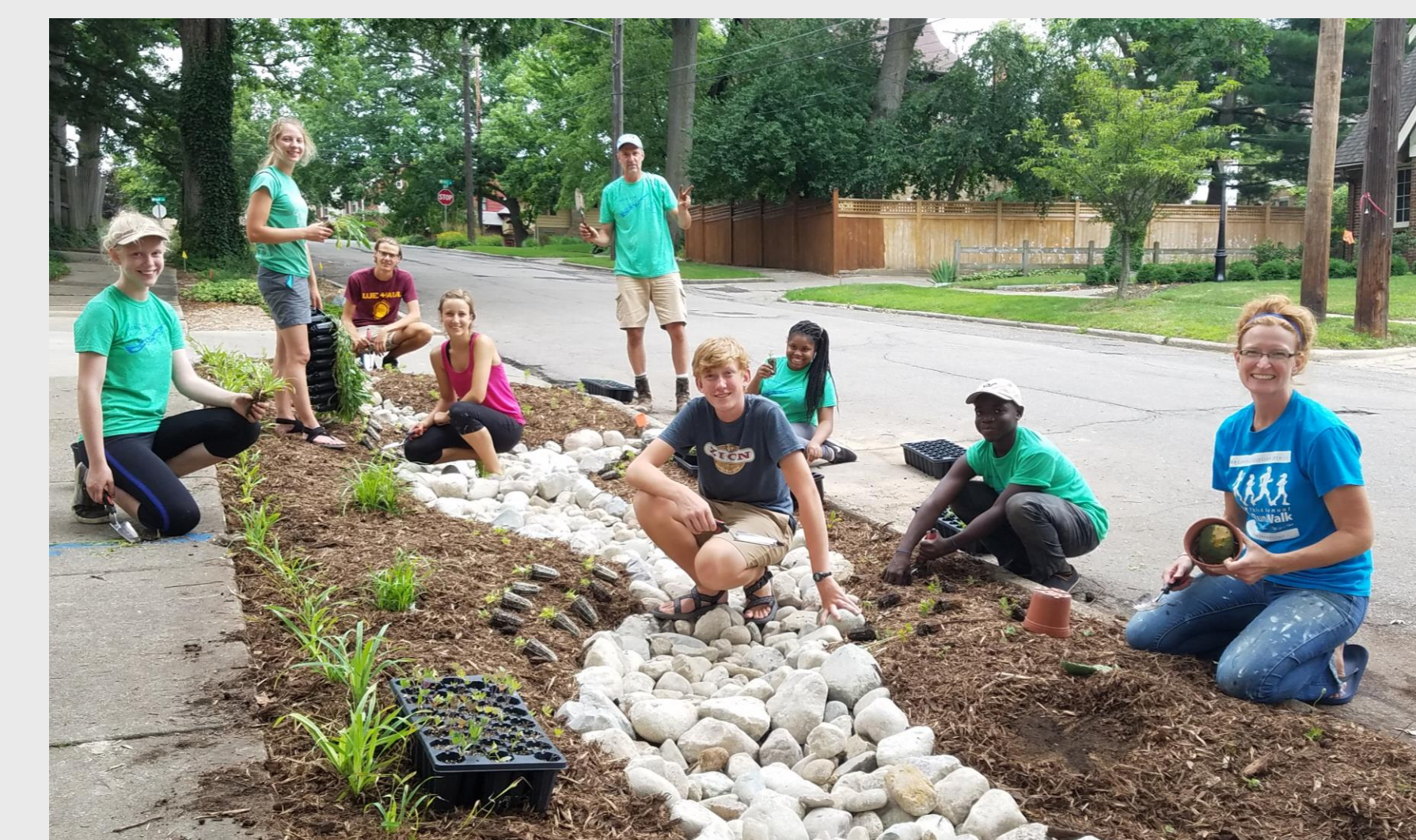
July Green Team plants a rain garden at a June Green Team member's house