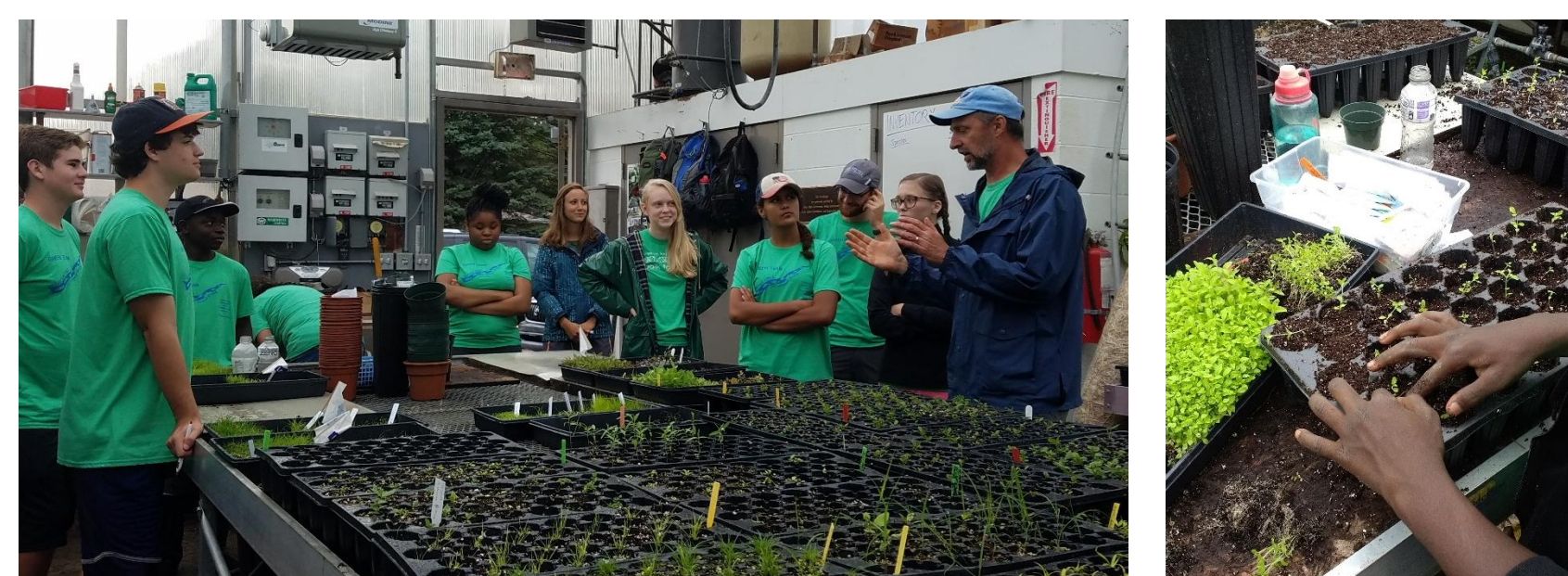
Students transplant native seedlings in the greenhouse

We performed maintenance on a bioswale and native landscaping around Catalyst, an environmental consulting business in downtown Grand Rapids. During our visit, we received a tour of the most highly LEED-certified building from Catalyst Partners president Keith Winn.