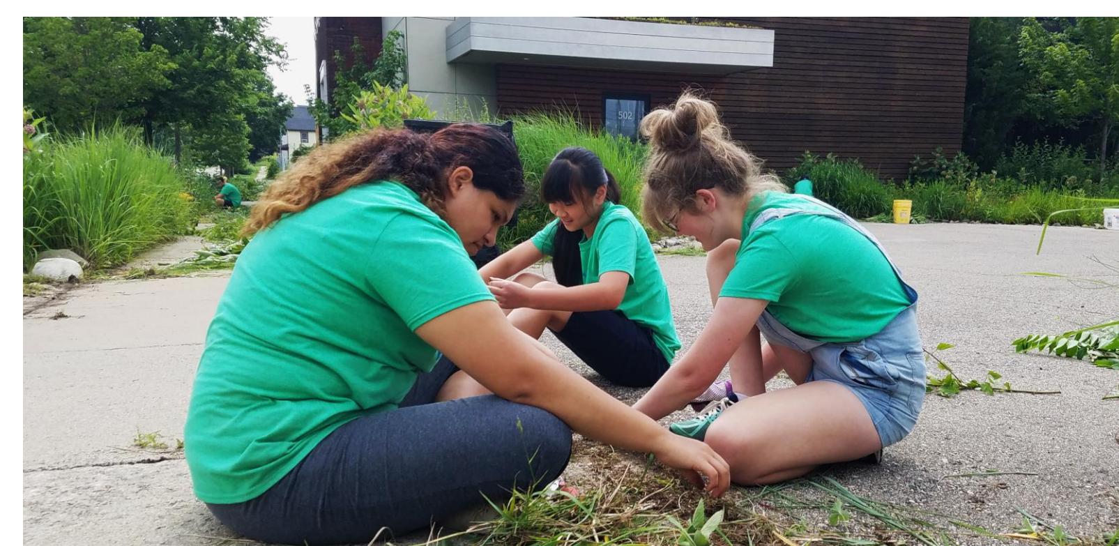
Maintenance at Catalyst Partners

"Overall I thought this was an incredible experience... One of the main things I learned was cooperation. I'm very proud to see how well we worked together. I got to know so many people through the conversations we had between weeding and wading in the creek... it was amazing to see an awesome result from our work."