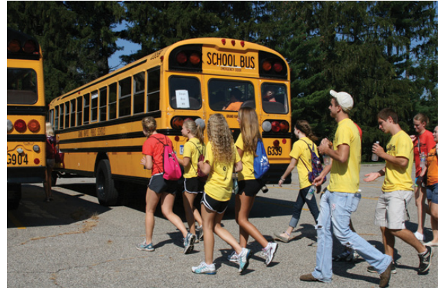
Students took buses, vans, bikes, canoes, the city bus, and walked to their agencies.

We are grateful to all the agencies that hosted us!