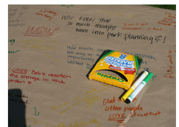
Students wrote out their initial reactions and reflections after their StreetFest experience.

having fun doing the tedious work together. I was able to connect with some of them, and they expressed interest and appreciation in the work that Catherine’s does. I also was excited to connect with the StreetFest leader who may volunteer with Catherine’s in the future. My work here will teach me many things, and I hope the StreetFest students could learn one or two ideas from me. With the StreetFest experience, I wanted the students to foster their passion and idealism which they will gain in and out of the classroom and then begin to apply it. I wanted them to see that the love, joy, lament, and justice that Calvin presents are not just feelings, but that they need to be actions.