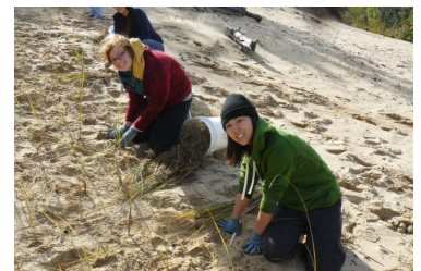
Creation Care students plant dune grass at Holland State Park

Eventually, the theoretical function manifests itself. To Klein, service-learning has a multi-layered theoretical value. First it provides students a shared experience outside their usual context, which gives them opportunities to reflect differently on the nature and purposes of the proximate relationships they have with their peers. Second, dissonant cross-cultural experiences can serve relationships with peers. When students' eyes have been affected by dissonant cross-cultural relationship, students take values and lessons from cross-cultural